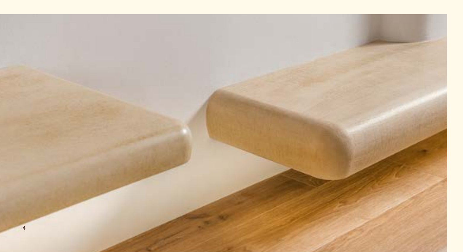
2099_1: backrest 378 Napa niche Soft 284 fire shelf Soft 177 in 6 cm and 11 cm Glaze: solnhofen with Terra pattern and solnhofen with Cotone pattern Technique: Spartherm KE 649,7

The design of the new REAL BIG TILES combines large surfaces with soft, smooth edges. The 6 and 11 cm high large molded parts lend tiled stoves and tiled fireplaces a classical appearance. Clean lines with distinctive curves – this is classic design reinterpreted.