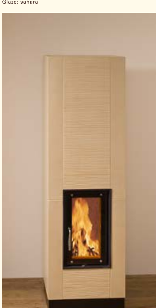
2072: Heat-storing tiled stove, square Glaze: sahara