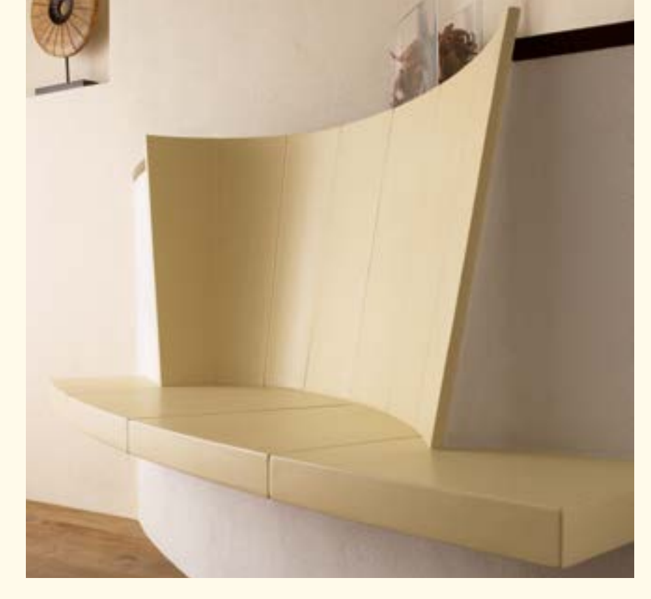
2047_1: fire shelf 179 backrest 378 Glaze: cacao dark, perla Technique: Brunner KE 351

"The Discovery of Slowness" – a wonderful book. Taking one's time to perform the activities of everyday life with the attentiveness they deserve - sitting together with friends and talking, reading a book or gazing absentmindedly into the fire. These are activities from which we draw strength for our everyday lives.