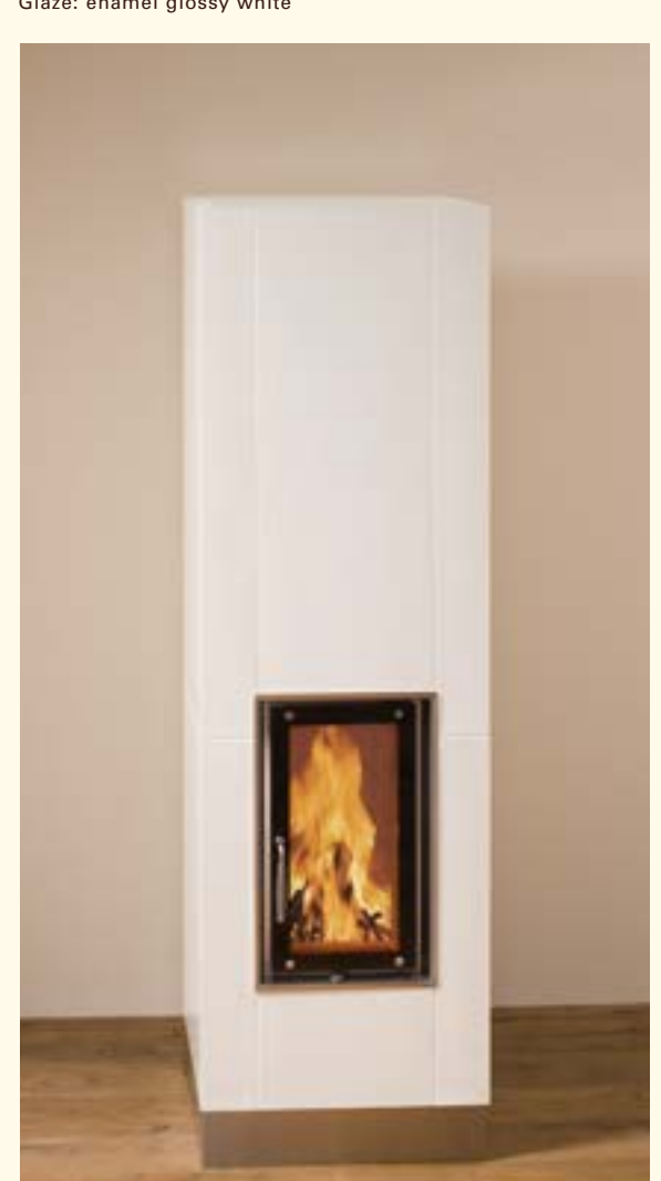
2073: Heat-storing tiled stove, square Glaze: enamel glossy white