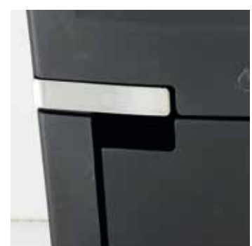
Integrated handle in stainless steel