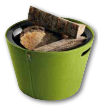
Aduro Proline felt basket Ø45 with plastic insert Ø45