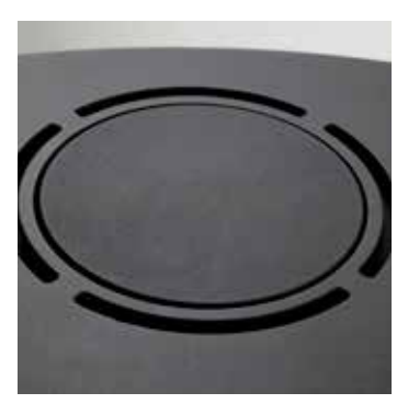
Smart integrated convection vents