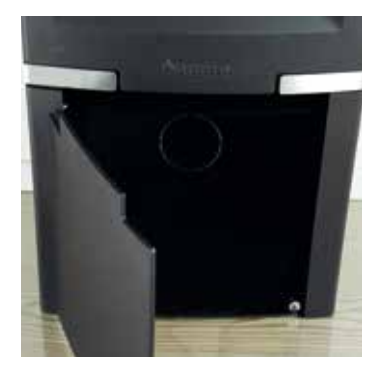
Large storage space with a door